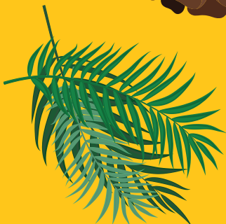
3 different leaves