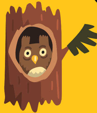
A tree hollow