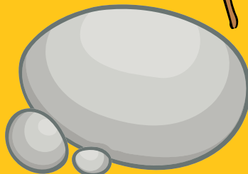
a magic stone