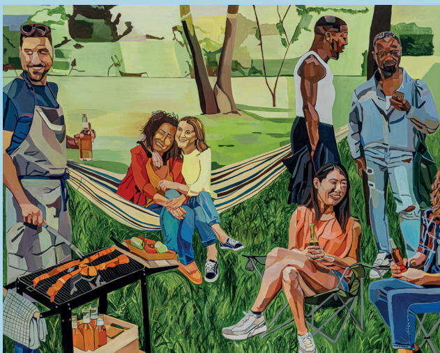
Top image: 'Imposterism', 2023, Lucy Waters.